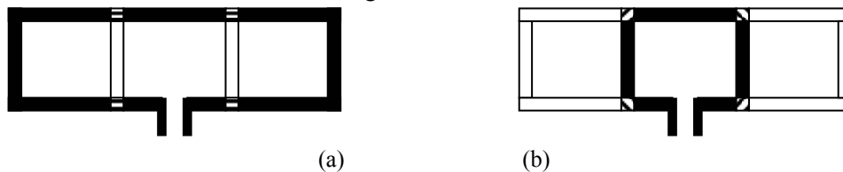
Figure 2 – Application of MEMS switch for reconfigurable antenna, (a) f_{opt}=f_a , (b) f_{opt}=2f_a